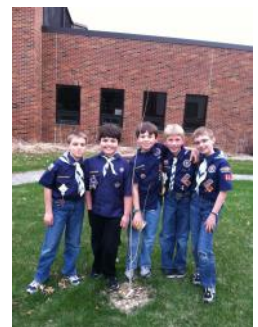
April 2011, Den 3, Pack 11 planted a tree on north side of church.

As an adult member of both organizations, we are grateful for the parish's generosity. Both Boy and Girl Scouts pledge service to God and country, so don't be surprised if you see us around St. Francis Xavier.