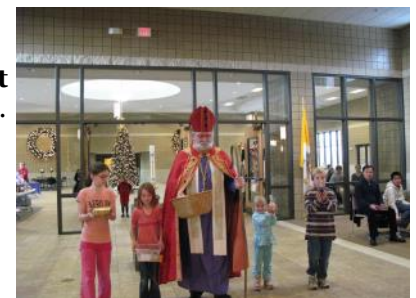
St. Nicholas and children bringing up gifts December 2013.